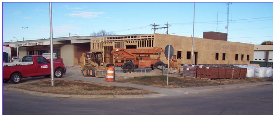
Grand Generation Center expansion progress as of December 1, 2006