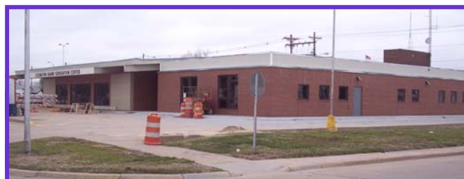
Early April 2007 shot of the GGC Addition (east side). The main exterior improvement left is the parking lot.