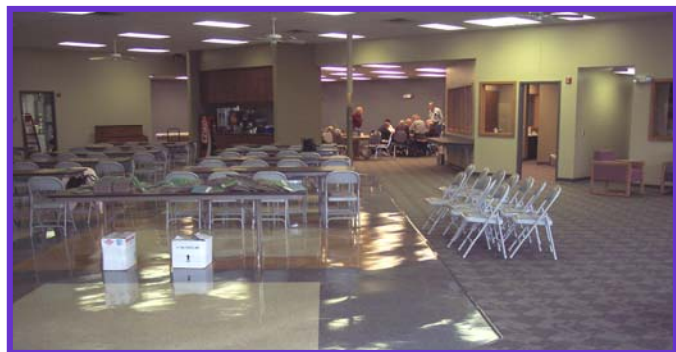
New tile and carpet greet visitors as they enter the renovated Grand Generation Center (looking NE)

B y early April the new addition to Lexington's Grand Generation Center was finished. Some minor remodel details to the original section are still underway. There will also be some parking lot improvements but, for the most parts, building crews are clearing out and the GGC staff is moving back in. Stop by and see your new and improved senior center at 407 East 6th Street!