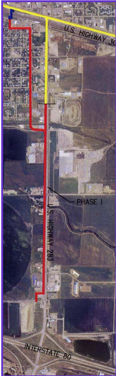
The red line shows Phase 1 of Lexington's Pedestrian / Bike Trail, which should begin construction this month, weather permitting.

On October 23, 2007, four sealed bids were publicly opened and read aloud, from contractors vying for the chance to build Phase I of the Lexington Pedestrian / Bike Trail. Cement Products Inc., of North Platte, won the contract with a low bid of $630,410.