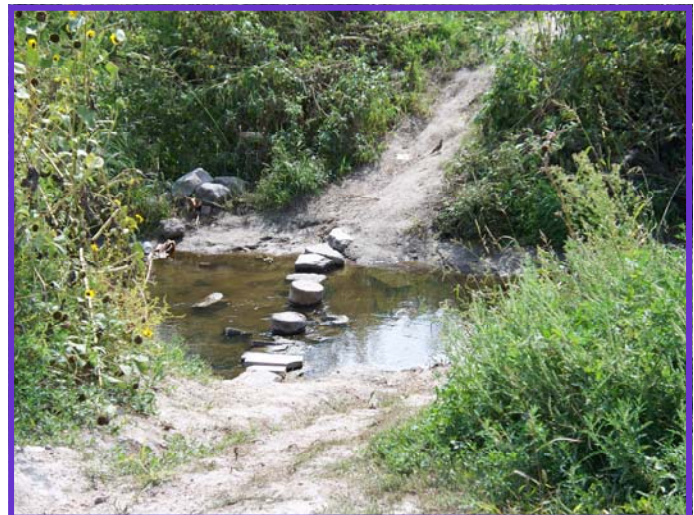
This makeshift bridge of stepping stones will soon be replaced by a concrete box culvert bridge across the drainage ditch just north of Cattlemen Drive.

Most of the cost will be reimbursed by federal Transportation Enhancement funds. The TE Grant process began in 2005. This project is expected to be completed in September of 2008.