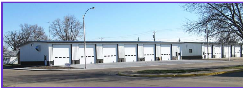
Mostly interior work is all that remains for new Fire & Rescue garage.