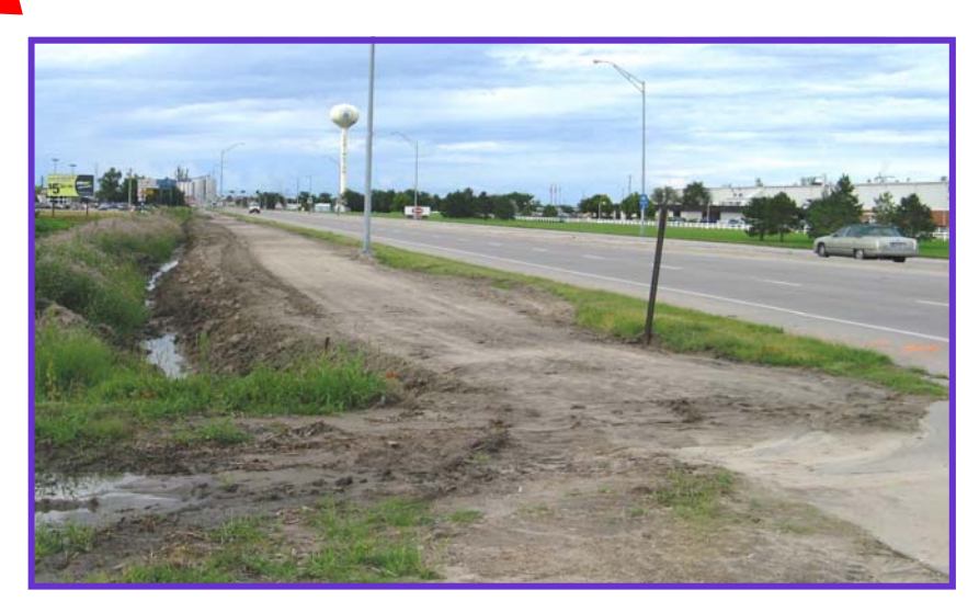
As of mid-August, subgrade preparation on Phase 1 of Lexington's Hike-Bike Trail . . . Looking north from Prospect Road on the west side of Plum Creek Parkway (Highway 283).

After a summer of digging, bulldozing, and pipe installation (and about three years of planning, engineering and endless paperwork), Lexington should soon see some concrete laid on a new 2.4-mile hike-bike trail. Most of the construction is on the west side of Plum Creek Parkway (Hwy 283). Frequent rains this construction season have slowed the project. The trail will go from near Sonic Drive-In in the south, cutting west a bit at Cattlemen Drive, then north across a drainage ditch to South Washington, eventually over to Madison Street where it will connect with the Pedestrian Overpass that crosses the Union Pacific Railroad.