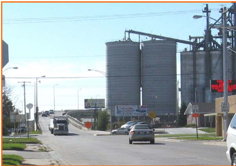
Looking south on the Highway 283 viaduct: both lanes were opened to traffic on October 19

Although not a project managed by the City, we sensed readers would appreciate learning more about the Nebraska Department of Roads (NDOR) project that included the Highway 283 overpass.