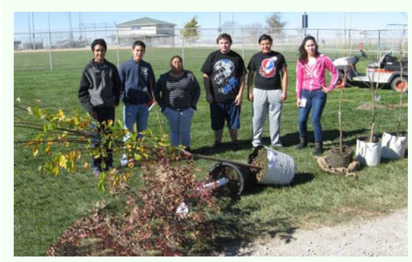
Lexington High School Ag students prior to planting the trees at the Optimist Recreation Complex