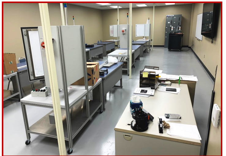
(top) - the pneumatic / hydraulic lab (bottom) - the electrical / motor lab