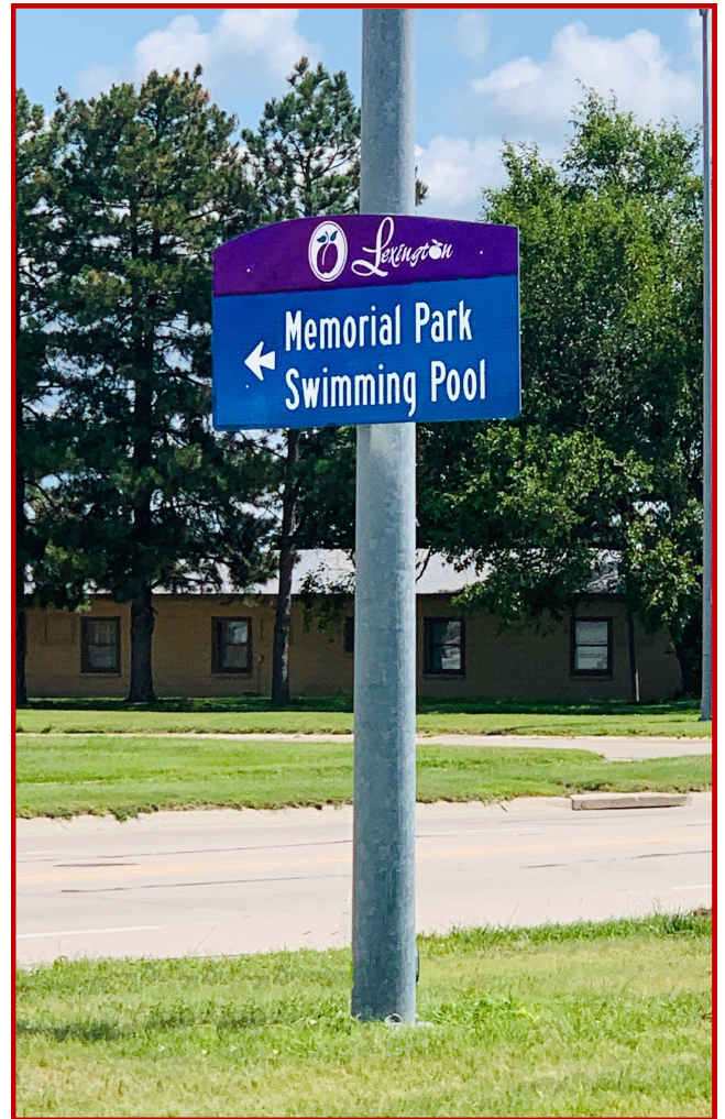
The first Wayfinding sign went up on eastbound Pacific Street (Highway 30), just west of Monroe Street.

Last but not least, most of the cost for the signs was funded by a grant from the Lexington Convention and Tourism Committee.