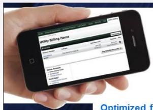
Optimized for mobile devices

Pay your utility bill using your computer, smart phone or tablet! Go to www.cityoflex.com to sign up and pay.