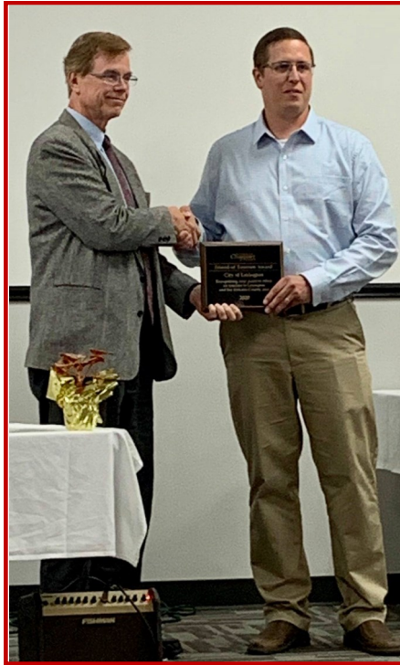
TOP RIGHT: One of the new Wayfinding signs. BOTTOM RIGHT: Plaque for the Friend of Tourism Award.