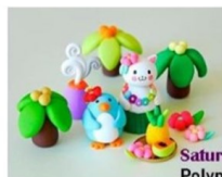
Saturday, October 9th Polymer clay