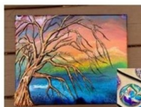
Saturday, October 2nd Acrylic Skin Jewelry & hot glue art on canvas