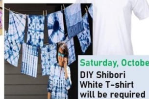
Saturday, October 16th DIY Shibori White T-shirt will be required