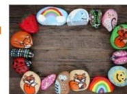
Saturday, October 23rd Alcohol ink / rocks