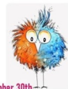
Saturday, October 30th Whimsical water color

Lexington PUBLIC LIBRARY 907 N Washington