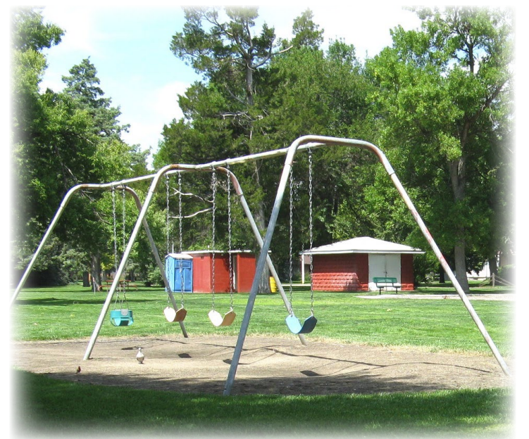
Table: 45: Plum Creek Park, Lexington

PLUM CREEK PARK 13th Street and Adams Street 23 acres