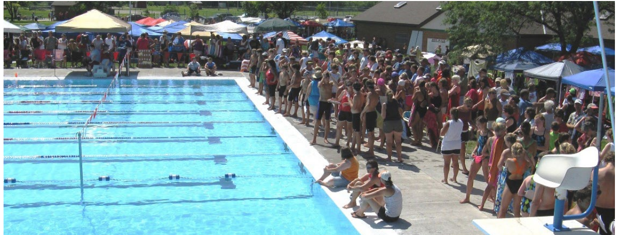
Figure 41: Kirkpatrick Memorial Park