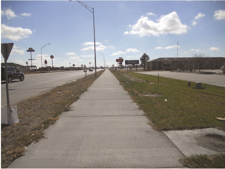
Existing Conditions along Plum Creek Parkway

Native plantings, fencing, and a meandering trail along the Plum Creek Parkway create an attractive community entrance.