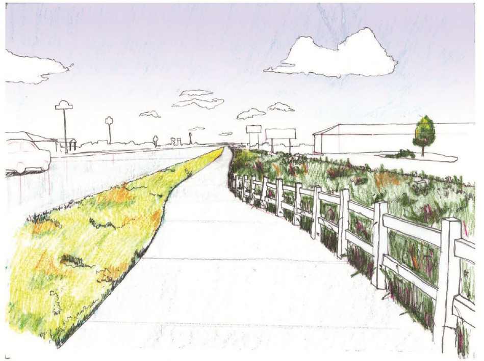
Proposed Improvements to Plum Creek Parkway