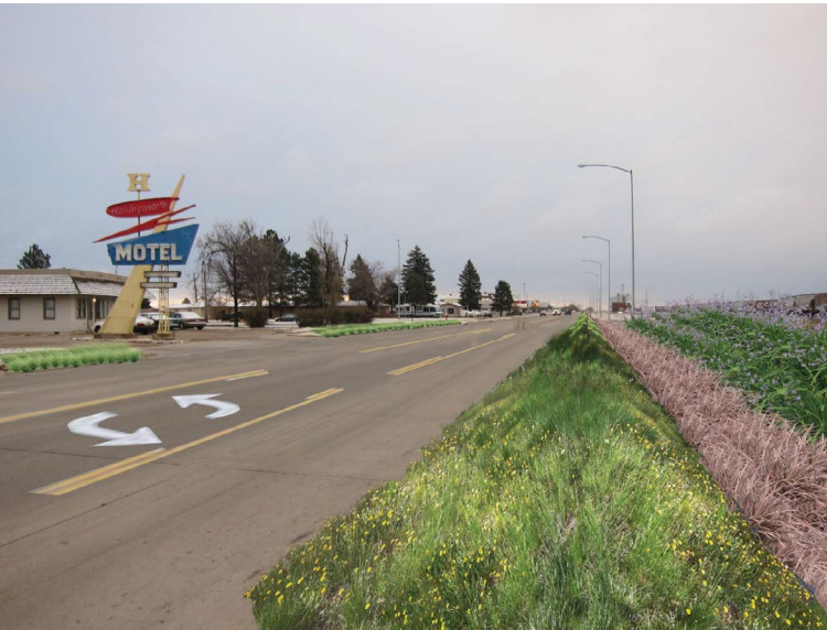
Proposed Improvements to Highway 30