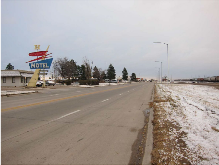
Existing Conditions along Highway 30

Reducing Highway 30 to three lanes provides more space for landscaping, creating a safer and more beautiful front door into downtown Lexington