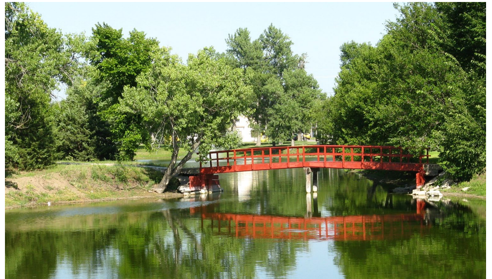
Figure 42: Plum Creek Park, Lexington