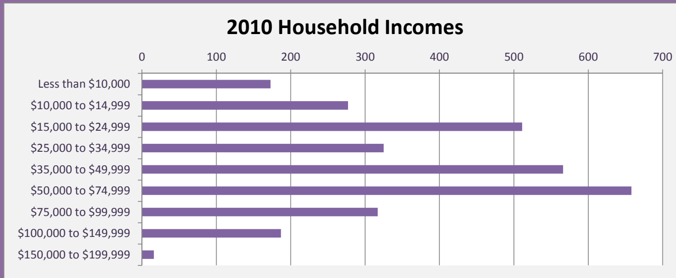
Figure 16: Household Incomes, Lexington, 2010